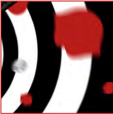
POST N°1 - (1080x1080) :

A free figure, explorer of avant-garde trends who breaks taboos and barriers in the name of an art that is in perpetual transformation. That which is true for Chantal Thomass is also true for Jaquet Droz.