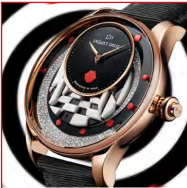
POST N°2 - (1080x1080) :

We were destined to meet. The result of this union is a unique piece, an automaton set with diamonds and minerals that is a hypnotic manifestation of master craftsmanship and fashion.